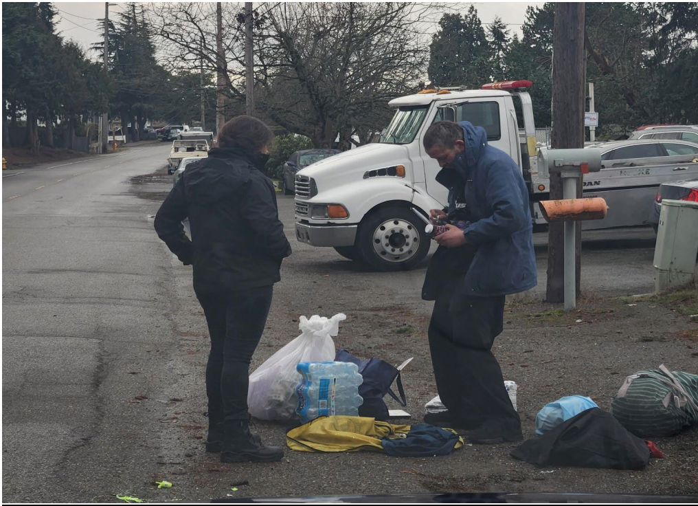
DMPD Crisis Responder (on left) getting people connected

Our GPS Team reached out to over 100 homeless people in the month of March to offer services and resources. Of those, 40 people accepted at least some sort of service or resource. This is a huge success for us.